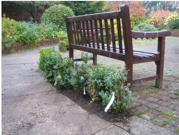
Box hedge planting

So by November we had cleared 4 beds in the memorial garden area, kept a number of plants that fit in with the new scheme and had spent some of the grant on other aspects of the bid – namely, replanting the box border around the fountain and labelling some of our previous planting.